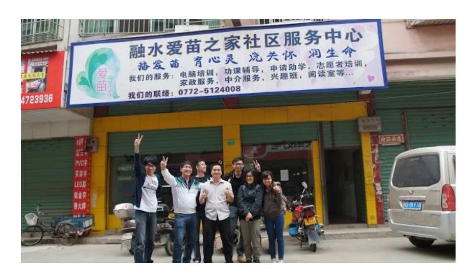
Figure 5 Visit to a community service centre in Rong Shui

This would be the last trip to Guangxi before signing the contract. Construction work of the project may start from mid-November. As a conclusion of the trip, the team members were impressed by the two previous projects of Project Mingde and looked forward to a visit to Dabao Village again after the completion of the project.