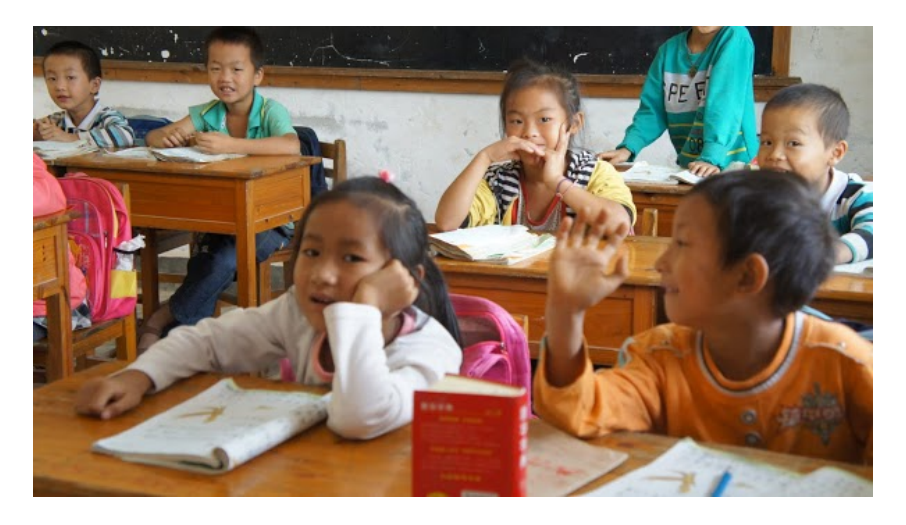
Figure 2 Students studying in Mingde Building