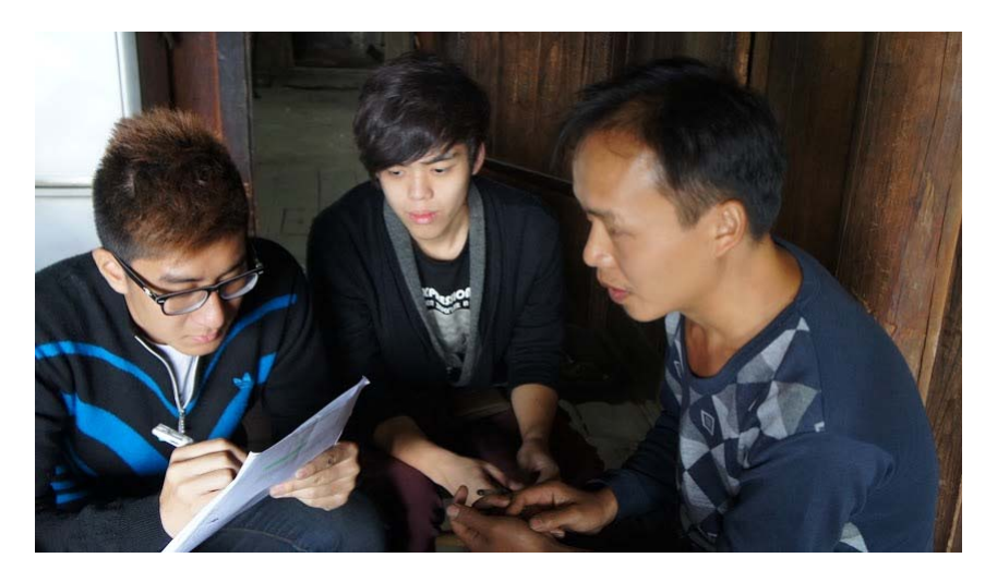
Figure 3 Interview with villagers in Dabao Village

Dr. Wong presented the latest amendments of the project to the representatives of Dabao Village after having lunch with them. Meanwhile, students conducted interviews with children and villagers to collect their views and expectations towards the project. According to the villagers, they were pleased with the project and thankful to the donor and Project Mingde team. They looked forward to the completion of the project.