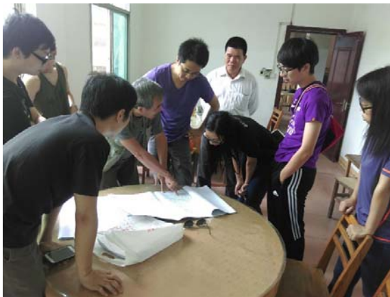
Figure 1 The team discussing the drawings

Upon early arrival to Rongshui on the first day, we visited a high school in the town centre. We walked around the school and observed its operation. We were surprised by student's perseverance to their study. The school was well organized and was full of cheering words advocating a positive attitude towards learning.