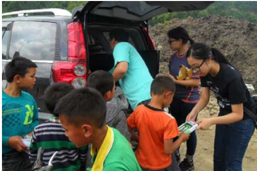
Figure 3 Distributing small gifts to children in Dabao

future reference after the trip. There are quite a number of design changes observed, we learn that it is very hard to strictly follow everything in the design, sometimes it is necessary to make slight modifications to suit the current situation. In the evening, we conducted a casual debriefing session. We tidied up our findings and observations, studied the drawings and shared our feelings to the Dabao project. It was a fruitful conversation as we have an in depth reflection towards the work on that day.