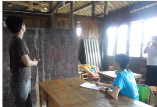
Figure 4 The team observing the current condition of Hongdeng Primary School

On the third day, we visited Hongdeng Primary School, teachers wholeheartedly hosted us with lunch. We chatted with them and listened to their stories of being a teacher in a village school. I really appreciate them as they are fully devoted to helping young children in rural village despite that they are facing a lot of hardship. We then observed the conditions of the school, played games with children, conducted interview with teachers and took aerial photo of the school.