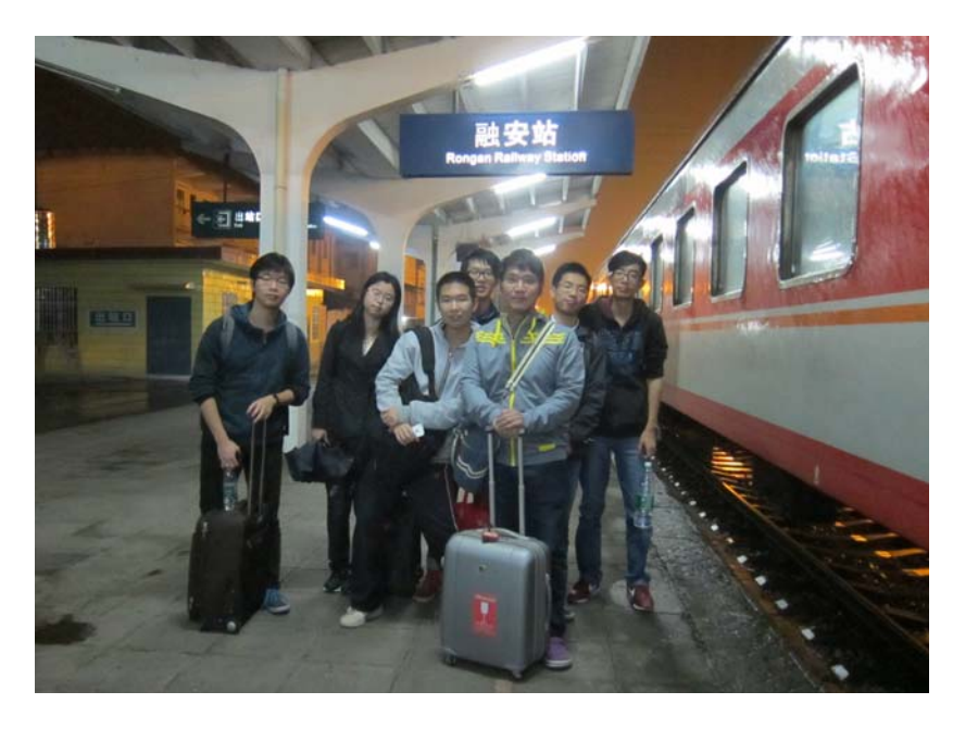
Figure 2 Arrived at Rongan at 3am!