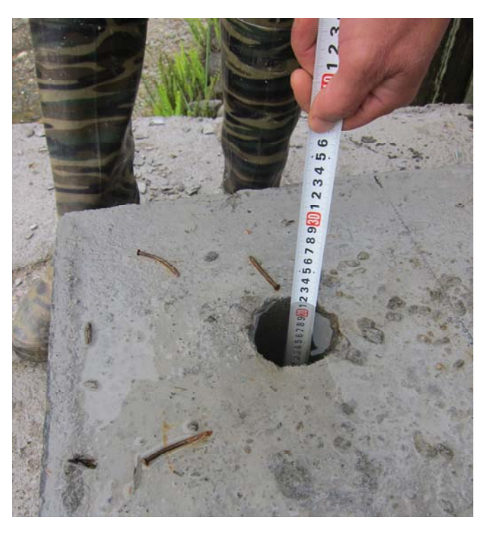
Figure 4 The design depth of these holes should be 300mm but 210mm is recorded.