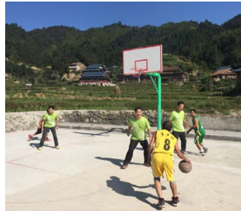
A friendly basketball match by representatives from Project Mingde and Dabao villagers