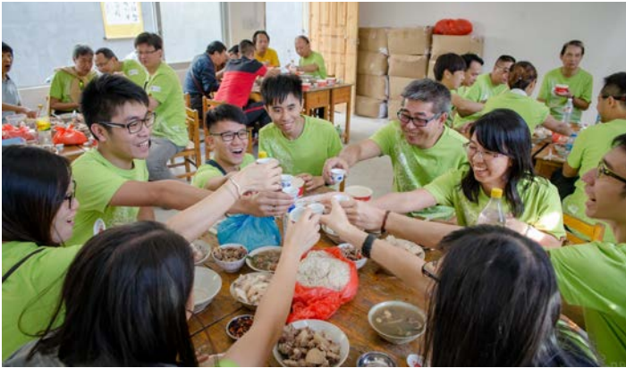
Lunch with Dabao villagers after the Ceremony