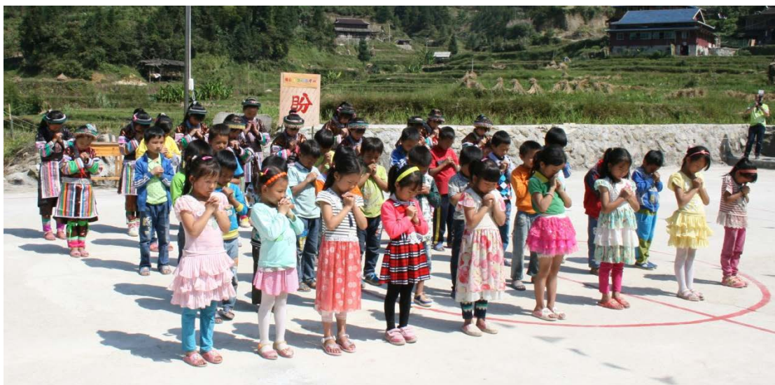
Singing and dancing performance by the local students.