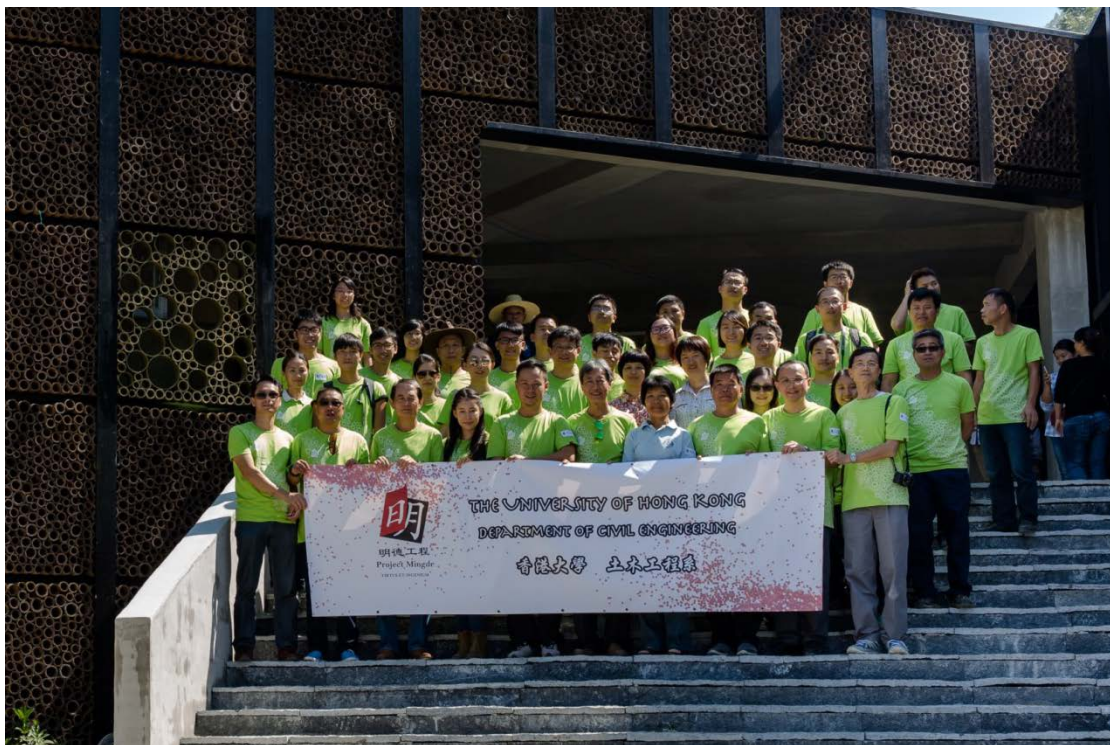
Group photo in front of the Mingde Pan Cultural & Community Centre