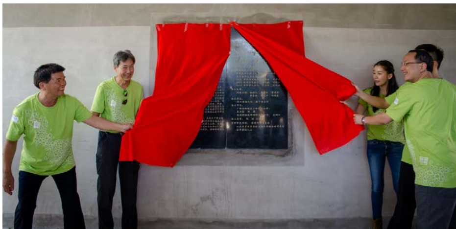
The unveiling of the commemorative plaque by the guests of honour.