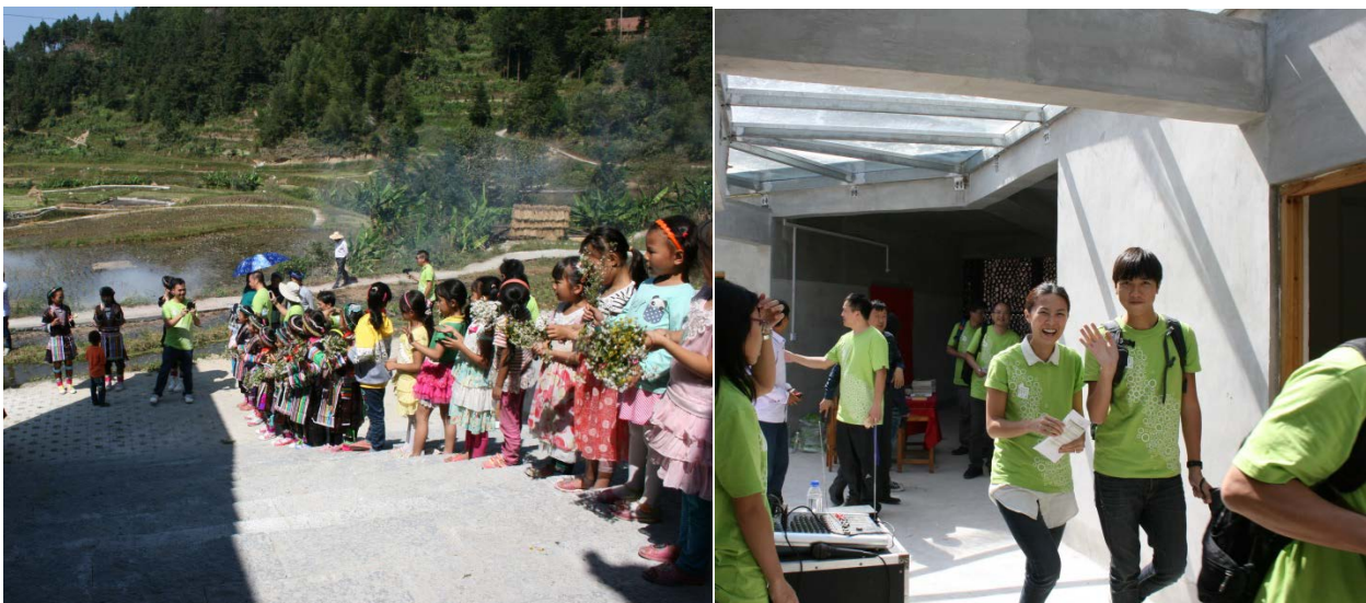
Local students are welcoming our honorable guests

To help people in need through applying our knowledge is always the mission of Project Mingde. We truly believe that Mingde Pan Cultural & Community Centre can help lead the local people towards a brighter future by providing a better place to study and, to grow.