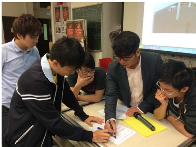
Figure 2: The current project team members also join the briefing session to meet the new comers.